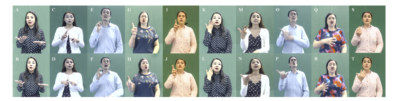
Figure 1: Examples of each sign from our dataset: A) "which one" statement, B) "which one" question, C) "which" statement, D) "which" question, E) "how" statement, F) "how" question, G) "what" statement, H) "what" question, I) "who" statement, J) "who" question, K) "when" statement, L) "when" question, M) "where(location)" statement, N) "where(location)" question, O) "where(direction)" statement, P) "where(direction)" question, Q) "where(direction)" statement, R) "where(direction)" question, S) "how much" statement, T) "how much" question.