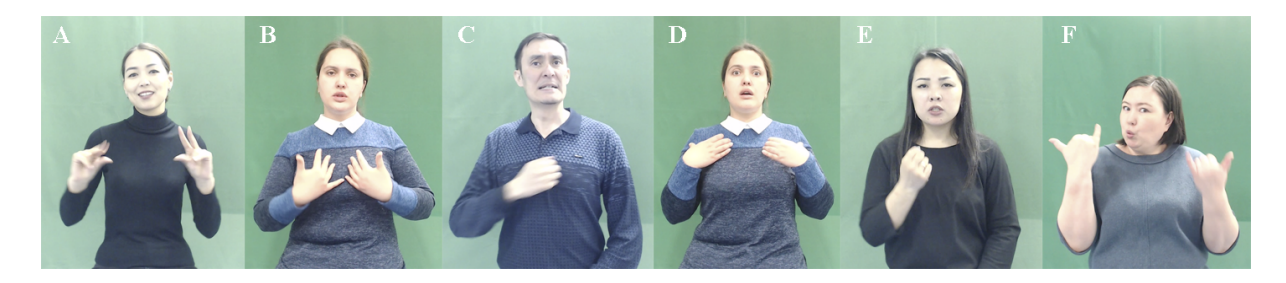
Figure 2: Emotions: A) "happy", B) "sad", C) "anger", D) "scared", E) "pity", F) "surprised".