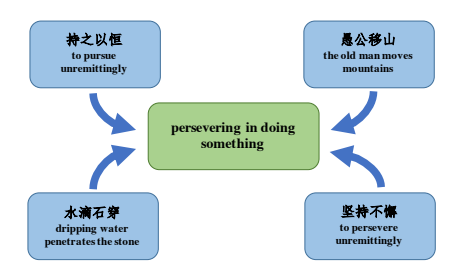
synonymic relationship v<sub>i</sub> v<sub>j</sub> candidate neighboring idiom synonyms