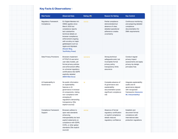
Figure 3: Browser Use Regulatory Analysis from the Generated Report, connecting library features to EU AI Act considerations.

understanding in assessing alignment with evolving regulatory landscapes.