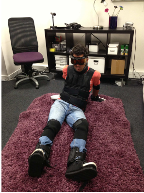
Figure 3: A young participant playing a fall scenario