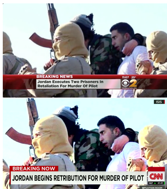
Figure 1: Similar visual contents improve detection of a coreferential event pair which has a low text-based confidence score.

To tackle this problem, a good starting point is processing the Closed Captions (CC) which is accompanying videos in newscasts. The CC is either generated by automatic speech recognition (ASR) systems or transcribed by a human stenotype operator who inputs phonetics which are