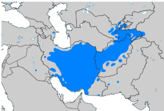
Figure 1: Regions that the majority of people’s mother tongue is Persian (Commons, 2021b)

Persian is an Indo-European language, with a subject-object-verb word order, and it has words borrowed from French and English. Additionally, its grammar is similar to many Indo-European languages. But also it has many words in common with Arabic, as Iran has Iraq as one of its neighbour countries and the official religious book for both countries is in Arabic.