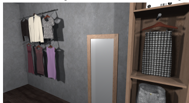
Table 1: Sample dialogue with a CE from the SIMMC 2.0 dataset.

Since the gold data from the test-std split is not available, we used the devtest data for our evaluation. Thus, some of the model object F1 scores may differ from their respective papers by a few decimals.