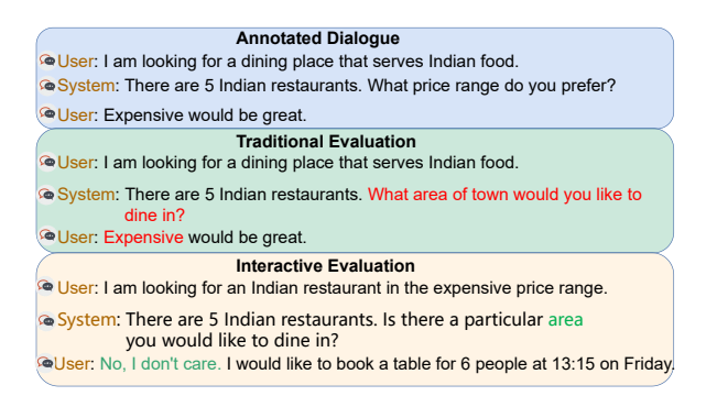
Figure 1: Illustration of interactions between users and systems. Traditional evaluation might face a policy mismatch between utterances annotated with red color.

Building intelligent dialogue systems has become a trend in natural language process applications especially with the help of powerful pre-trained models. Specifically, task-oriented dialogue (TOD) systems (Zhang et al., 2020b) are to help users with scenarios such as booking hotels or flights. These TOD systems (Wen et al., 2017; Zhong et al., 2018; Chen et al., 2019) usually first recognize user's intents and then generate corresponding responses