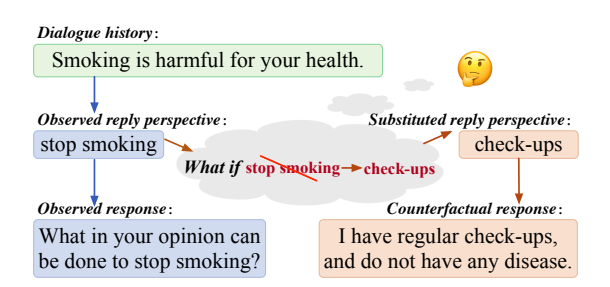
Figure 1: An example of a counterfactual response, which is a semantically different response re-inferred by changing the observed reply perspective.

A feasible solution to address this problem is to use data augmentation techniques. Currently,