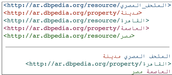
Figure 4: A sample random walk (top) and its corresponding generated sentence (bottom). Some, but not all, of the IDs are replaced with their surface form.

retrieval. Habash et al. (2019) proposed to extend MT’s output with gender-specific re-inflections. We believe their work is very promising, but it is currently limited to first-person sentences. To avoid such bias, our translators were asked to concatenate both forms where relevant. This, however, comes at a price: the queries are less natural and the duplication may introduce a new bias. An alternative approach, which we plan to explore in future work, is to choose one form at random and rely on the retriever to escape gender bias by leveraging morphological analyzers and language models.