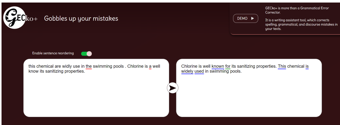
FIGURE 2 – GECKo+'s interface.

GECKo+ employs a simple but effective color code to highlight mistakes. Changes are highlighted token-wise : deletions are underlined in red, modifications in blue, and additions in green. Currently there is no explicit indication of how sentences have been reordered. Ideally, a user should be able to visualize which sentences were swapped. We leave it for future work. Refer to Figure 2 for GECKo+'s interface with an example sentence containing various spelling, grammar, and discourse mistakes.