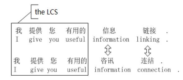
Figure 3: A parallel sentence pairs written in simplified script for Chinese mainland and traditional script for Hong Kong

In short, we firstly extract the LCS between the parallel sentences, then collect the different word of sequence, thirdly we segment the different portions, and finally generate the initial triple if the size of the segmentation of the different portions are same. Currently, we have generated 12,375 initial triples using the above algorithm as shown in Figure 2. To be more specific, column 2 in Table 1 illustrates the statistics of the initial GCR triples (word dictionary). We illustrate the algorithm using the example shown in Figure 3. After removing the longest common subsequence, we segment the remnant word of sequence, and get the "信息 /xin xi/information", "资讯/zi xun/information", "链接/lian jie/linking", and "连结/lian jie/connection" pairs accordingly. We take sentences written in simplified script for Chinese mainland as a bridge, and conduct similar process for sentence pairs for Chinese mainland and Taiwan. Then we can get the initial word dictionary (triples).