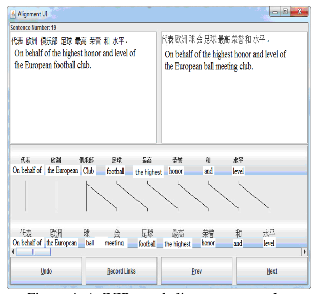
Figure 4: A GCR word alignment example

Firstly, we automatically extract 10,000 sentence pairs from Wikipedia (5,000 for Mainland-Hong Kong and 5,000 for Mainland-Taiwan) and 2,000 sentence pairs from news website (1,000 for Mainland-Hong Kong and 1,000 for Mainland-Taiwan) after the preprocessing phase described in Section 3.1. Then, we employ the word alignment annotation tool shown in Figure 4 to annotate word alignment for the GCR.