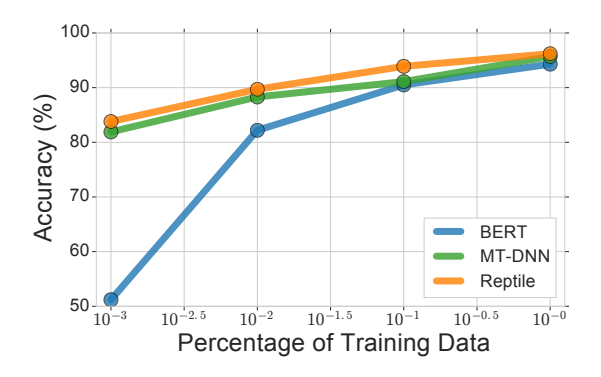
Figure 2: Results on transfer learning. The target task is SciTail which the model does not come across during the meta-learning stage.

development sets are shown in Table 3. We find that setting k to 5 is the optimal strategy and more or fewer update steps may lead to worse performance.