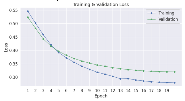
Figure 1: Training and validation loss curves of our BERT model with 20 epochs.

20 epochs, otherwise, the model will be overfitted. Figures 2 and 3 present the confusion matrices of our BERT model with 20 epochs and the decision tree model, respectively. The confusion matrix of both models demonstrates that the dataset is imbalanced as shown in Table 1. We also noticed that the ratio of 77:23 after improving the original dataset is close to the ratio shown in the confusion matrix. That indicates that our models are well trained. To select the best model we compared the F1-score.