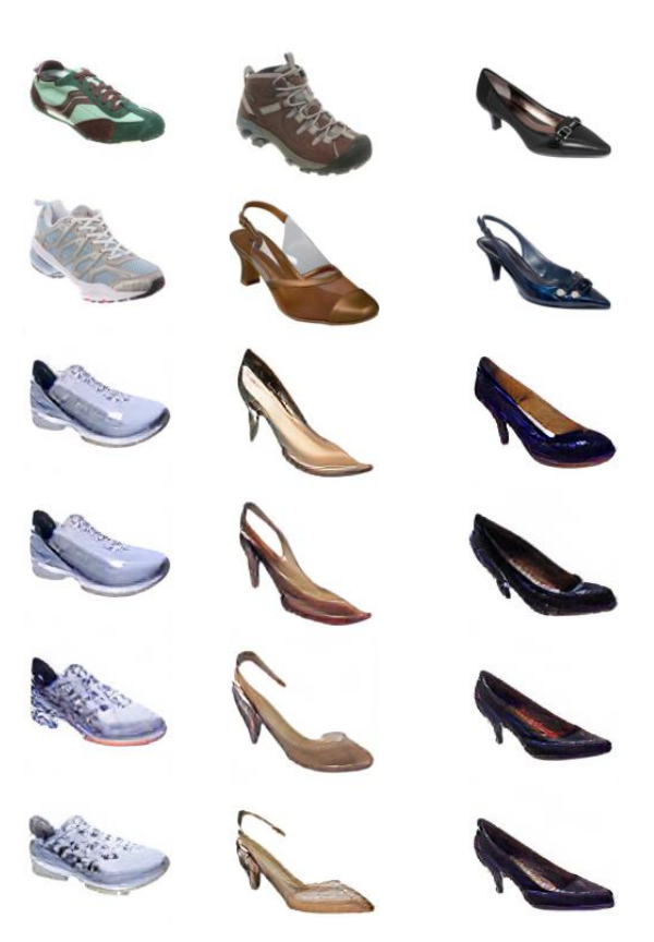
Figure 3: Examples of CIA for error analysis. First row: source images. Second row: target images. Remaining rows: top four generated images. Textual instructions for image alteration in left column: "athletic shoes are blue and silver"; middle column: "athletic shoes are bronze-colored slingbacks"; right column: "pumps are blue".

Additional problems occur when the images to be generated are too similar to the source image (see 3rd column), or the generated images are too similar to each other (see 3rd and 4th images in the 1st column). While not necessarily a problem for the overall quality of the output, the first kind of cases becomes an issue for evaluation, as generated images may be more similar to the source image