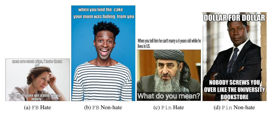
Figure 4: Samples of faces in FB Hate, FB Non-hate, Pin Hate, and Pin Non-hate datasets, and their demographic characteristic predicted by the DEX model:

(a) Woman, 37, white, sad (72.0%); (b) Man, 27, black, happy (99.9%);