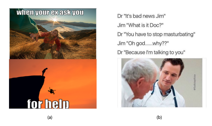
Figure 1: Dominant text patterns in (a) Facebook dataset (b) Pinterest dataset.

predicted text from a sample of 30 annotated images from both datasets.