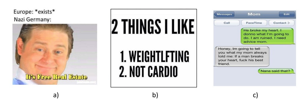
Figure 2: Different types of memes: (a) Traditional meme (b) Text (c) Screenshot.

To prepare the data needed for training the ternary (i.e., traditional memes, memes purely consisting of text, and screenshots) classifier, we annotate the Pin dataset with manual annotations to create a balanced set of 400 images. We split the set randomly, so that 70% is used as the training data and the rest 30% as the validation data. Figure 2 shows the main types of memes encountered. The FB dataset only has traditional meme types.