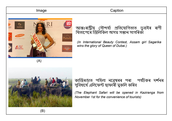
Figure 2: An example of Assamese caption dataset