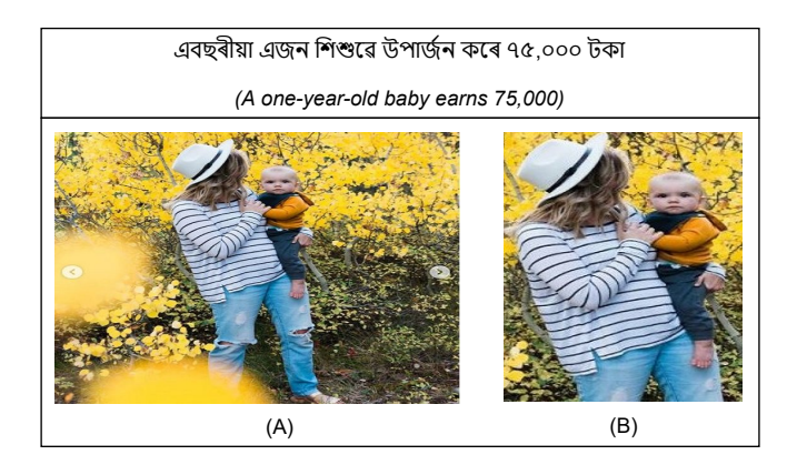
Figure 1: Image cropping