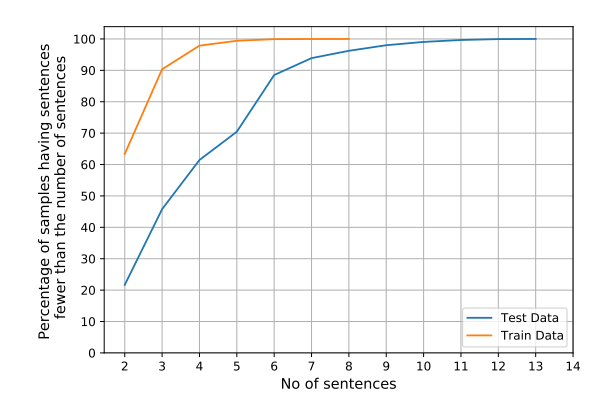
Figure 2: Analysis of Reddit data: Number of sentences Vs Percentage of samples

• It is unlikely that the response text depends on the farther context sentences. So, the response text largely depends on context sentences that are closest to the response text.