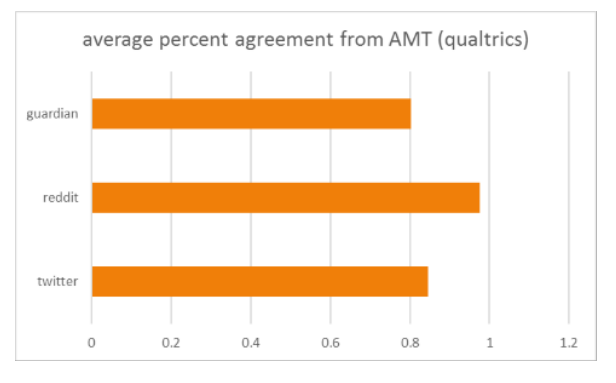
Figure 3: Average Percent of Agreement Among Amazon Mechanical Turk (AMT) Annotators

As shown in Figure 2 and Figure 3, average agreement is below 90% for the Guardian