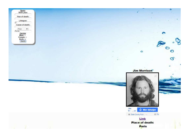
Figure 1: Screenshot of the interface

We stored the resulting data in a SQL database with three tables: persons, origins, and profes-