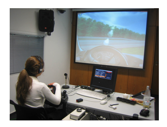
Figure 2: Experiment setup

The personal/impersonal style variation is not applicable for some dialogue moves, e.g., (9), and for output in telegraphic style.