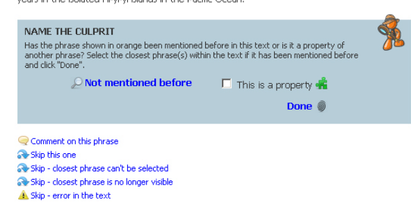
Figure 1: A task presented in Annotation Mode.

The order's remarkable variety was the natural outcome of evolution acting over millions of vears in the isolated Hi-vi-vi islands in the Pacific Ocean.