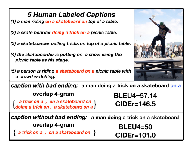
Figure 1: A demonstration of the sequence with bad ending has higher BLEU and CIDEr scores compared to the one without.