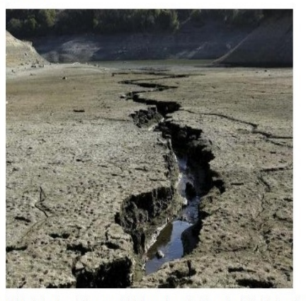
OSLO - A slowdown in the pace of global warming so far this century is likely to be only a pause in a longer-term trend of rising temperatures, the science academies of the United States and Britain said on Thursday. Environment, Science 27 Feb 2014

Global warming slowdown likely to be brief: U.S., UK science bodies