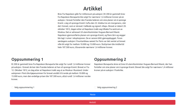
Figure 2: Screenshot of the interface used during human evaluation. We present a news article on top, and two suggestions for summaries. The goal for the evaluator is to choose the summary they prefer based on simple criteria (see §6).

els we have evaluated here. However, we chose to rely exclusively on open-source models with Norwegian language support to ensure accessibility and reproducibility for future research.