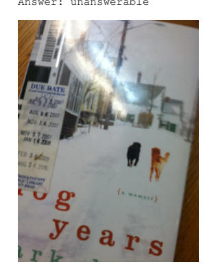
Question: What is the title of this book? Answer: dog years

Question: What does the arrow say? Answer: unanswerable