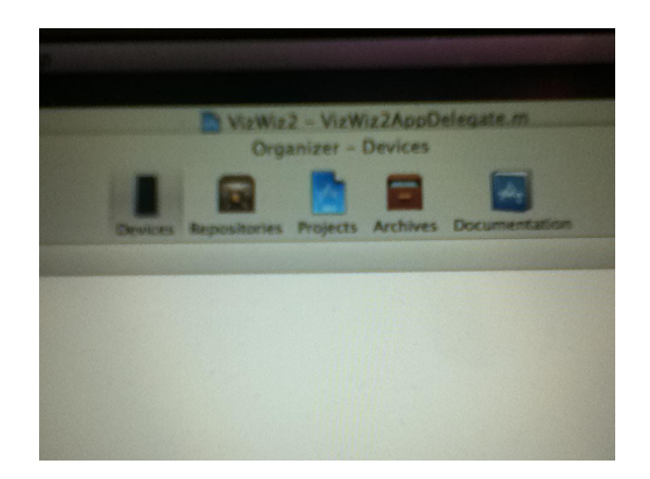
Figure 6: Question "What action is currently selected?". The top 3 answers by PaLM2 Bison with their likelihood are ('projects', -0.69), ('archives', -0.76), ('devices', -1.13). The correct answer is devices but this information is not in the gold captions, captions can never be complete. The captions are 'The computer digital monitor screen with some websites open to', 'A quick link bar has appeared on an Apple computer screen.', 'Computer menu bar with options: Devices, Repositories, Projects, Archives, and Documentation.', 'some type of MacBook or laptop device u CNA use', 'A VizWiz app that has an organizer and lists projects and archives.'.

These findings shed light on critical areas for improvement in models designed for this particular user group, showing that well calibrated systems are important in this domain.