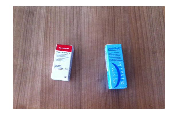
Figure 7: Question "Which one is the blue one?". The top 3 answers by PaLM2 Bison with their likelihood are ('blue', -0.47), ('second', -0.63), ('right', -0.82). The first answer is true but useless for a visually impaired person. The top 3 answers by LLaVA 13B Bison are correct. They are ('right', -0.08), ('right', -0.08), ('right', -0.08), ('right', -0.08), erson.