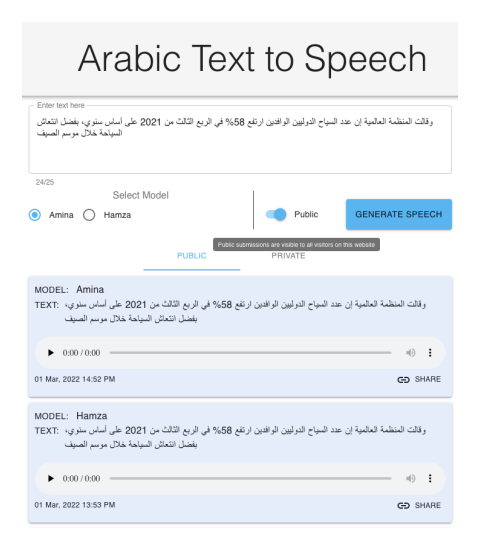
Figure 1: NatiQ system in action

Lastely, the systems were assessed with Real-time Factor to evaluated decoding speed of each model.