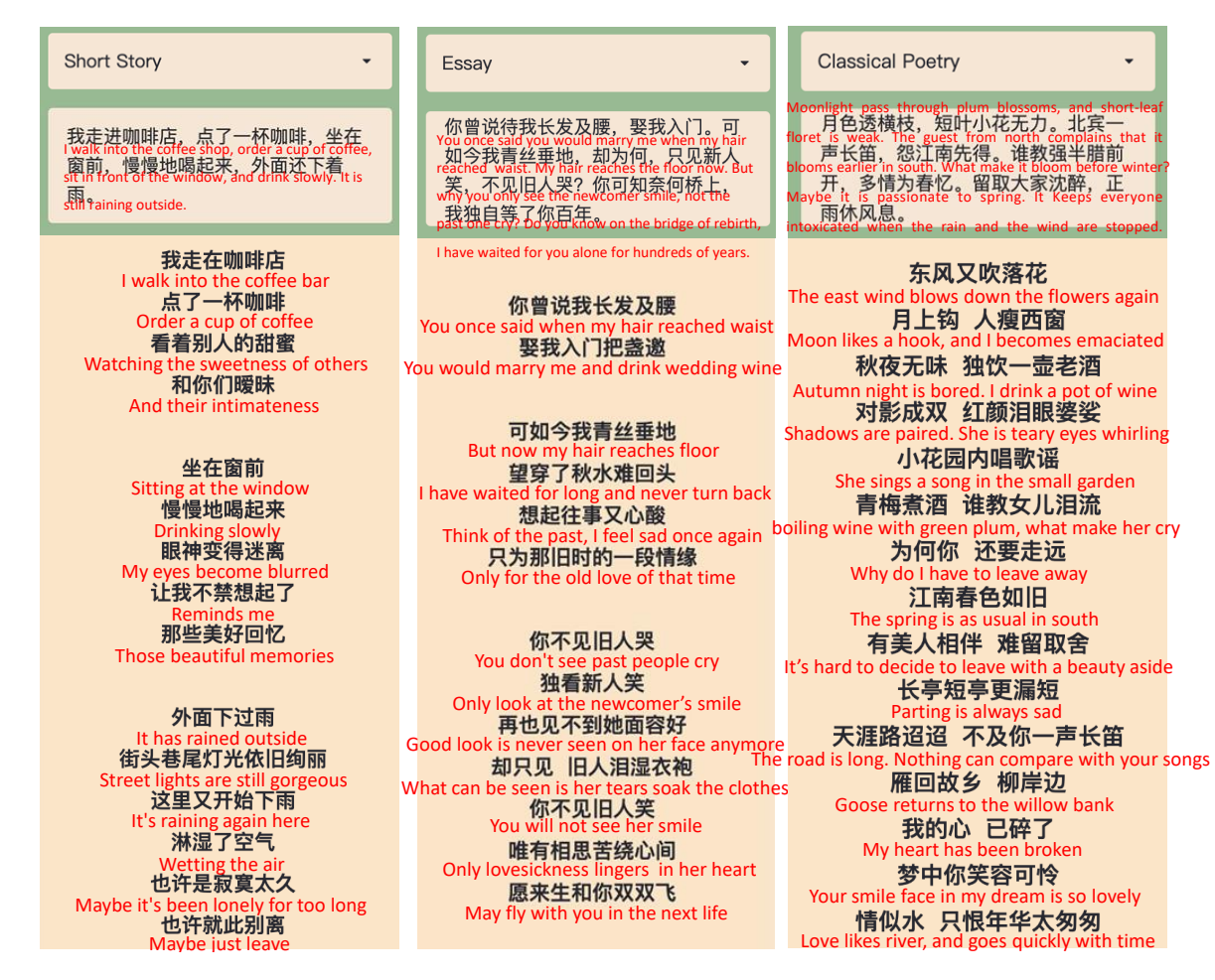
Figure 5: The examples of generated lyrics for different text inputs, including short story, essay, classical poetry.

Test set: We sampled 30 passage-level inputs for each of four genres (short story, essay, modern poetry and classical poetry), totally 120 samples.