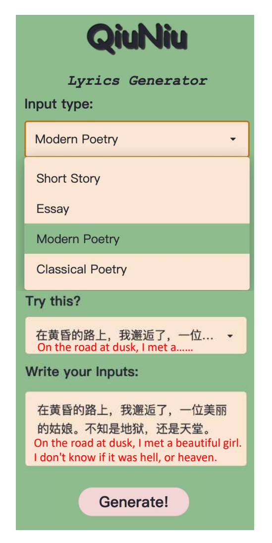
Figure 4: The interface of the user input. Users can write multiple forms of passage-level text as input. Several examples of input are provided for each type.

candidate lyrics are good and use its confidence as the lyrics score Score_l . We used the lyrics of popular and classic songs as positive examples and the lyrics of less played songs as negative samples. The model is based on pretrained Chinese Bert (Devlin et al., 2019) implemented by Transformers<sup>5</sup>. Experimental results show that our model prefers to give high scores to graceful and ornate lyrics, such as metaphorical sentences, rather than the verbose and plain ones.