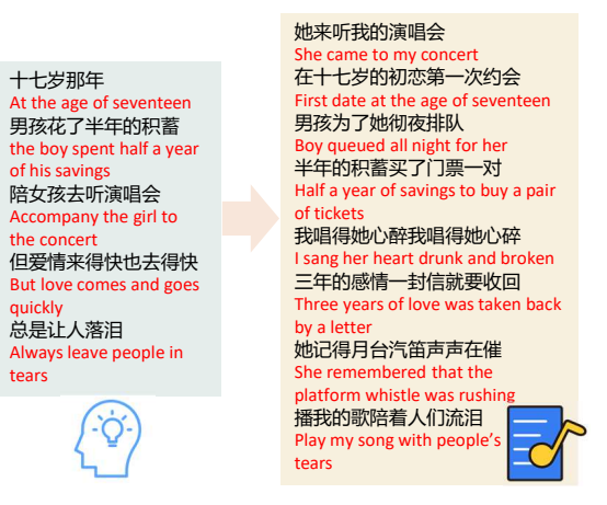
Figure 1: This figure depicts a typical creation pattern: the author firstly conceives a rough draft (in the left box) and then polishes it to the final work (in the right box).