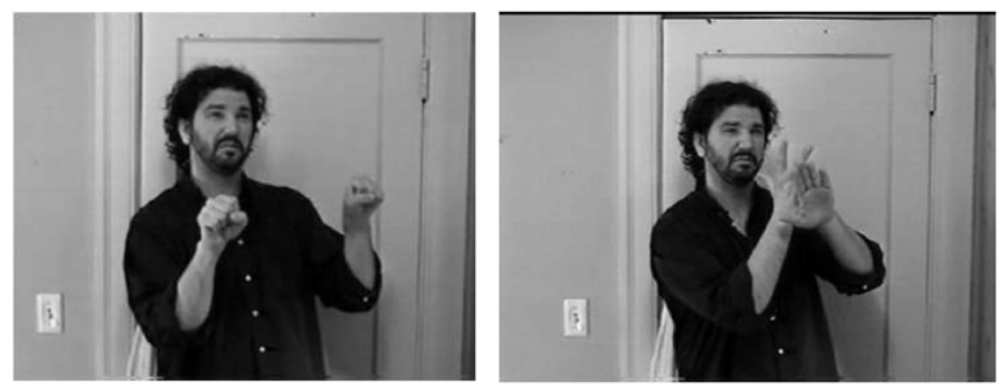
The motorcyclist driving up a hill Figure 1. Classifier usage (Dudis, 2004).

can be used to describe the size and shape of an object, and they can also represent how an object moves or is utilized. Through the use of classifiers, a signer can describe a scenario with few discrete lexical items. The signer creates an image in space. This is not simply an informal gesture as there are well-documented linguistic rules governing classifier usage (Lepic & Occhino, 2018). These are evocative, not necessarily iconic, and are extremely powerful. In a story about a motorcycle ride (Dudis, 2004), a signer can use an instrument classifier to indicate that the rider is revving the engine and a vehicle classifier to show the rider driving away on a hilly highway (Figure 1).