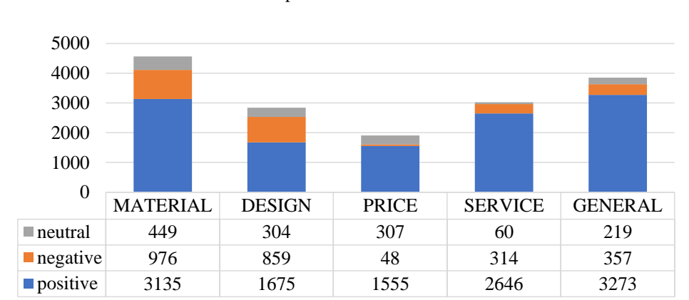
Table 2: Some samples from the ViCloABSA dataset.

SERVICE:negative MATERIAL:positive PRICE:positive DESIGN:negative