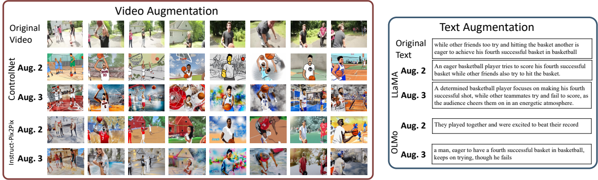
Figure 4: Qualitative examples of data generated by DREAM. “Aug. 2” and “Aug. 3” refer to augmentation by text paraphrasing and video stylization and augmentation by relevance enhancing.