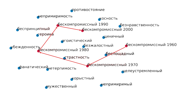
Figure 2: Alterations in meaning of the Russian adjective 'бескомпромиссный' ( uncompromising ): from ruthless over fanatical , passion , later conviction , heroic to intransigence , confrontation

Both mean distances and mean deltas from the 60s can be used with any method of measuring semantic change of the 3 described above, thus overall we have 6 scores to assign to each word in our word lists.