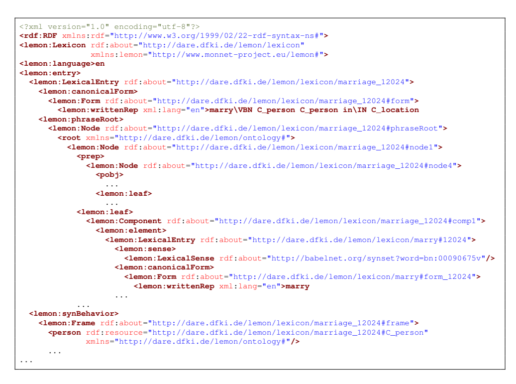
Figure 3: Excerpt from the sar-graph pattern for the phrase "SPOUSE1 and SPOUSE2 got married in LOCATION on DATE." In Lemon format; closing tags omitted for brevity.

riage , parent-child , siblings ) and biographical information ( person birth/death ), but also typical inter-business relations and properties of companies (e.g., acquisition , business operation , head-quarters ). Using Freebase' query API, we retrieved a total of 223K seed instances for the 25 target relations.