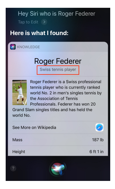
Figure 1: A motivating example question that demonstrates the importance of short textual descriptions.

Despite being rich sources of factual knowledge, cross-domain knowledge graphs often lack a succinct textual description for many of the existing entities. Fig. 1 depicts an example of a concise entity description presented to a user. Descriptions of this sort can be beneficial both to humans and in downstream AI and natural language processing tasks, including question answering (e.g., Who