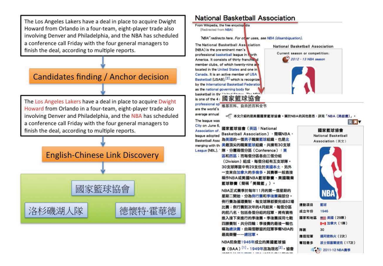
Figure 1: Processing flow of our system.