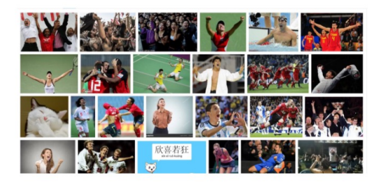
Figure 1: The example of scene that people may imagine with the word "欣喜若狂"(ecstatic). These images are directly downloaded from the Internet.