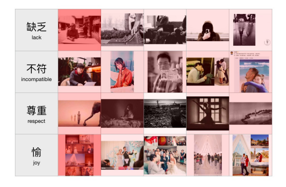
Figure 4: The attention heat map of words and images shows that it cannot attend on words only, while often attend on irrelevant images.

out some problems and propose some possible solution. For the severe problem of image mentioned above, maybe we can use some image dataset with English label such as ImageNet since it is much bigger, then translate the Chinese word to English to obtain corresponding pictures and using Google search for auxiliary. Another reason should account for the bad performance is the lack of training data, it is hard to train a large network by using less than three thousand instances. To tackle this problem we can also incorporate English corpus with VA ratings to pretrain our model, or train a network for sentiment classifier first and transfer the weight to initialize our model.