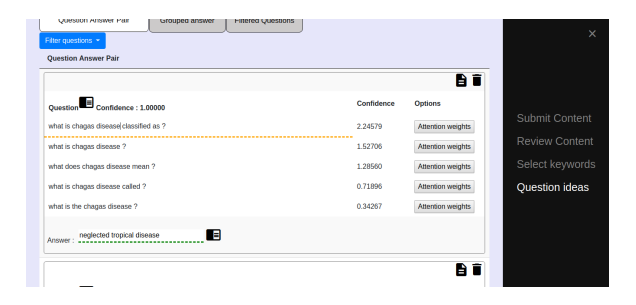
Figure 3: Editing question and answers.