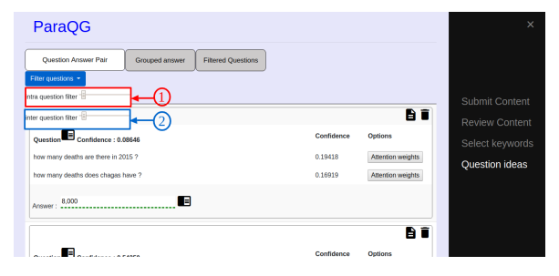
Figure 6: Clustering question based on different facets of the answer.

tion answer pairs he/she may edit it. The system stores all version of questions and answers. Users can download the final generated set of questions and answers in JSON or text format at the end.