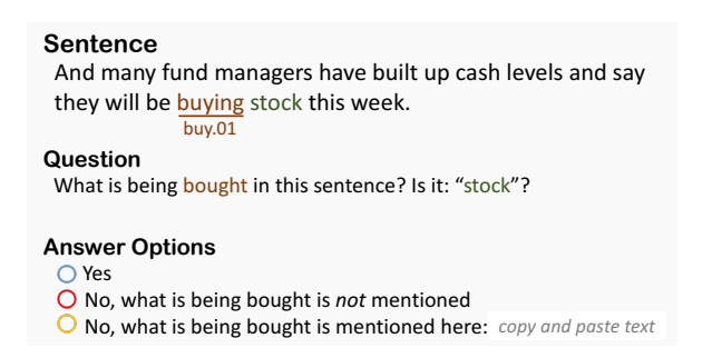
Figure 2: Example annotation task, consisting of a sentence with predicted role labels, a human readable question regarding to one label, and a set of answer options . By answering, crowd workers curate a prediction made by the SRL.

To design the annotation task, we replicate a setup proposed in previous work (Akbik et al., 2016) in which crowd workers are employed to curate the output of a statistical SRL system. This setup generates annotation tasks as following: