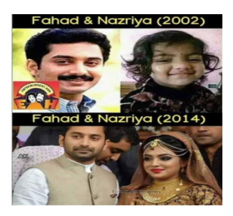
Figure 1: A sample Troll meme

We experimented with several deep learning models to extract visual and textual features. After investigating the outcomes, an early fusion approach is employed to combine the features from both modalities. The results indicate that the textual models acquired higher f_1 -score compared to the visual and multimodal counterparts.