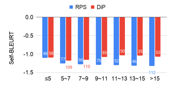
Figure 2: The Self-BLEURT scores across different lengths of generated text. The numbers indicate the number of instances in each bucket.