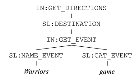
Figure 1: Example decoupled semantic frame representation (Aghajanyan et al., 2020) for the utterance Directions to the Warriors game .

In this work, we investigate the strengths and weaknesses of transformer-based semantic parsers