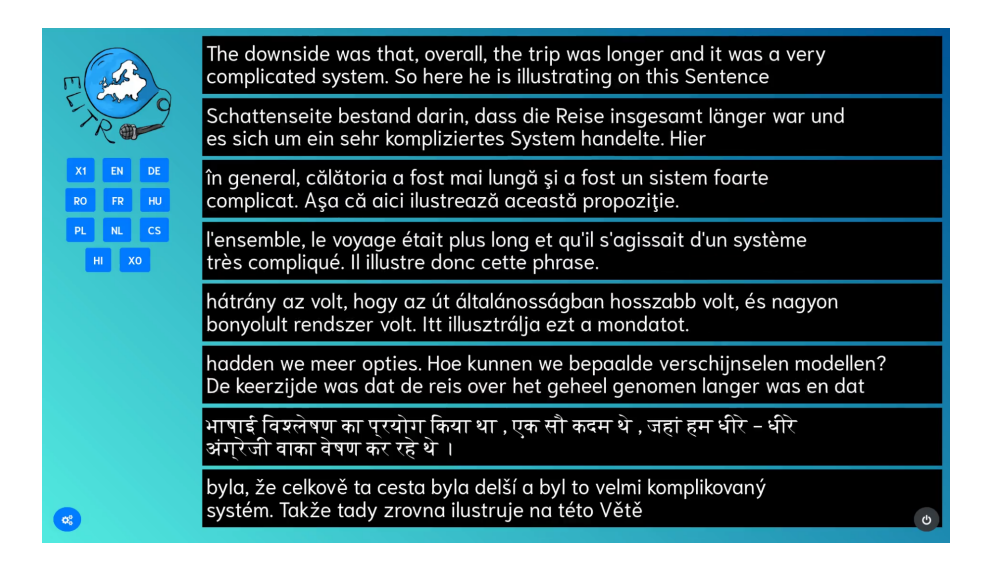
Figure 1: A screenshot of subtitle view from a presentation given in Czech (last row), automatically transcribed and translated to English (first row) and then from English into several other languages. The various processing and network delays lead to slightly different timing of each of the languages.