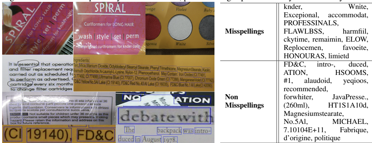
Figure 1: Product Images after OCR processing

This paper aims to automatically and accurately identify misspellings from product images in order to improve customer experience. We loosely define a misspelling as "incorrectly spelled ubiquitous words and proper nouns which are very similar to their correct forms". Example images and words are present in Figure 1 and Table 1 respectively. As can be seen, product images predominantly contain many